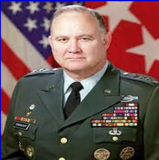
Norman Schwarzkopf, Jr.